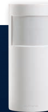
Wall mount occupancy/ Vacancy sensor: Width: 1.80" (46mm) Height: 4.35" (110mm) Depth: 1.35" (34mm)