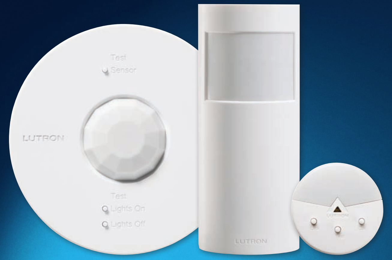
Ceiling mount occupancy/vacancy sensor (actual size)