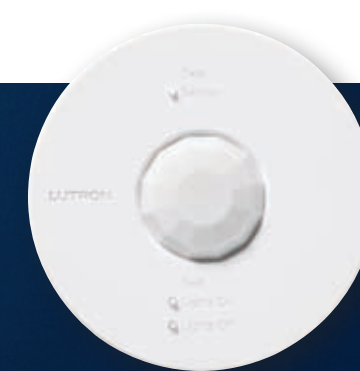
Ceiling mount occupancy/ Vacancy sensor: Diameter: 4.00" (102mm) Depth: 1.30" (33mm)

Radio Powr Savr sensors are part of a system and cannot be used to control a load without a compatible RF dimming or switching device.