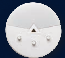
Daylight sensor: Diameter: 1.60" (41mm) Depth: 0.70" (17mm)