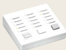
15-Button with Raise/Lower