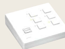
6-Button with Raise/Lower