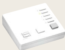
5-Button with Raise/Lower