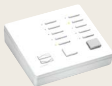
10-Button with Raise/Lower